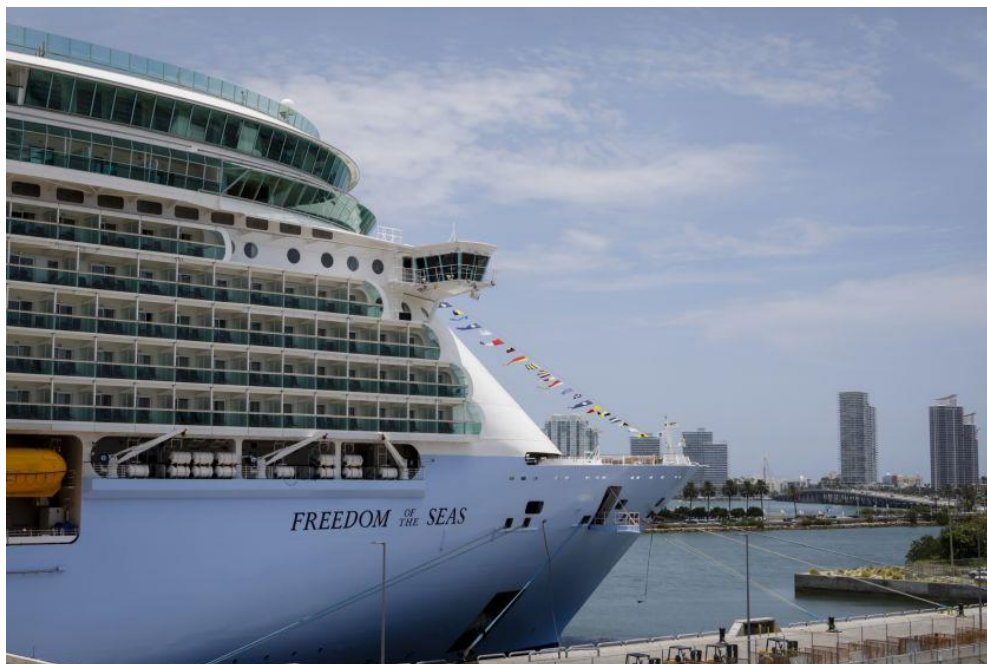
A ship docked before departure from PortMiami in June on a shakedown cruise before its return to post-pandemic service