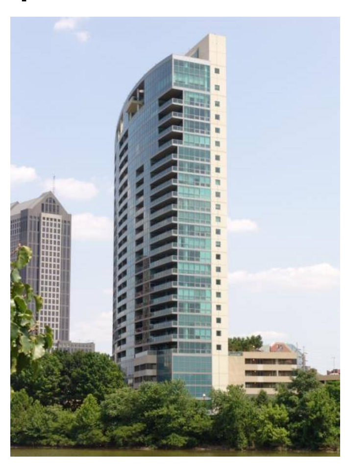
Brownfield is again a productive parcel.