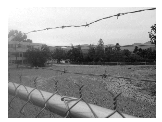
Figure 1: Rear View of A Street Building

Several reports and studies have been commissioned by the County to evaluate the possible redevelopment of the campus into senior and multi-family housing, assisted living, commercial, office, and retail. The County is currently making a determination as to whether they will retain ownership of the Campus or pursue a private sale for future development.