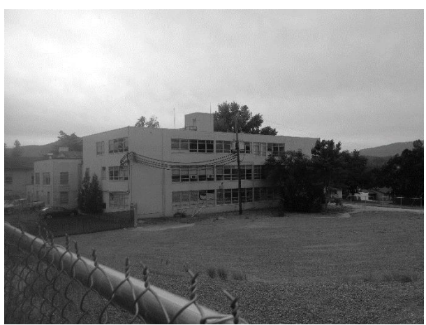
Figure 2: Site of Former Dimmick Tower