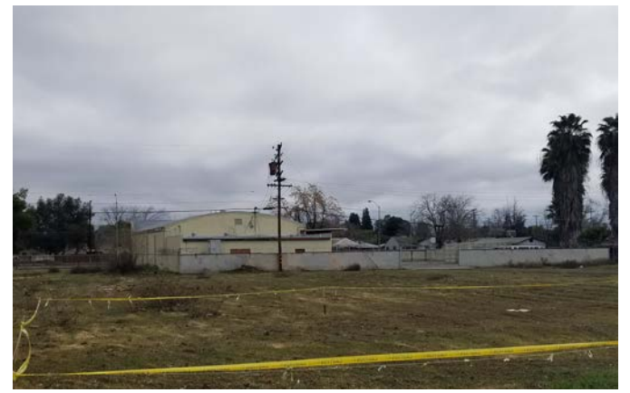
The future site of the Youth Ministry Center and public use Park on the St. Rest Campus

The St. Rest property is the northern entrance to the Elm Avenue Corridor, a 2.25-mile long corridor connecting several economically disadvantaged southwest Fresno neighborhoods along a stretch of many vacant and potentially contaminated lots. A legacy of automobile industry and related uses has left behind several vacant and blighted properties along the corridor. The area's poverty rate of 43 percent and an unemployment rate of 21 percent are more than double the state averages. With ample land available for development and a prime location next to downtown, Southwest Fresno is a promising reinvestment area.