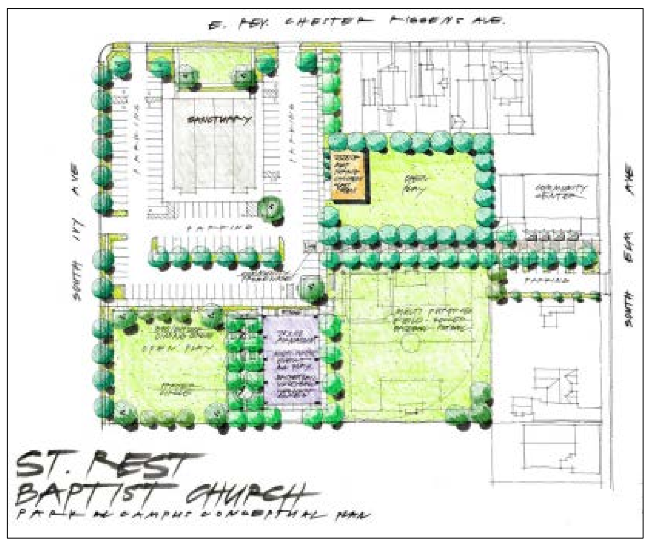
Conceptual Site Plans of the 3.5-acre St. Rest Campus

The objective of the Project Response Team was three-fold: 1) to provide ideas for the immediate needs of the St. Rest Expansion; 2) to provide long-term financing strategies to St. Rest to achieve their long-term vision; and 3) to provide recommendations to the City to support redevelopment of a greater number of Elm Avenue properties in Southwest Fresno.