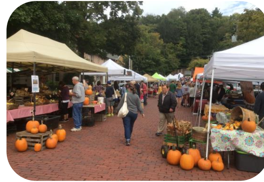
Social, economic connectedness