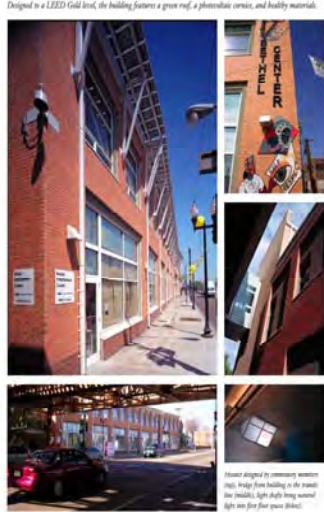
Bethel Commercial Center