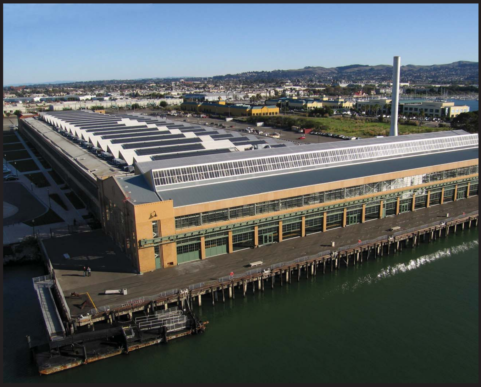
The Ford Richmond Plant, Richmond, California