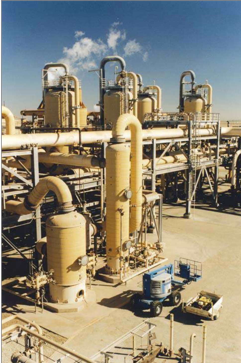
Salton Sea (California) Geothermal Plant