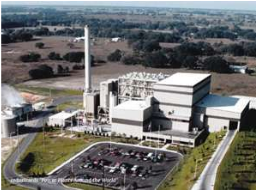
Lake County, Fla., WTE plant

Because of its high water table, Florida has a stronger incentive than most states to find alternatives to putting solid wastes in landfills. Some Florida coastal counties even have landfills that begin at ground level and rise as high as 200 feet (61 m). State legislation and incentive programs since the 1970s have caused Florida to have the largest capacity of waste-to-energy (WTE) facilities of any state. Not counting the new Ridge Generating Station, there are 12 WTE plants in Florida with a combined capacity of 486 MW.