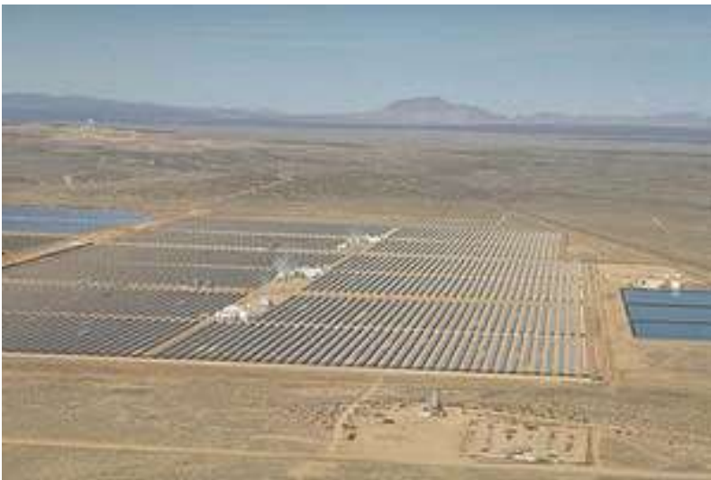
Solel and FPL Energy layout in Mojave desert.