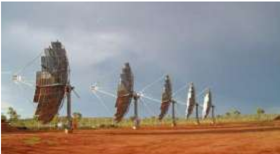
Solar concentrating PV dishes at Yuendumu in Australia's Northern Territory

Solar Systems has also constructed four new concentrator dish power stations at Hermannsburg : (192 kW), Yuendumu (240 kW), Lajamanu (288 kW), and Umuwa (220 kW). Together they generate 940 kW.