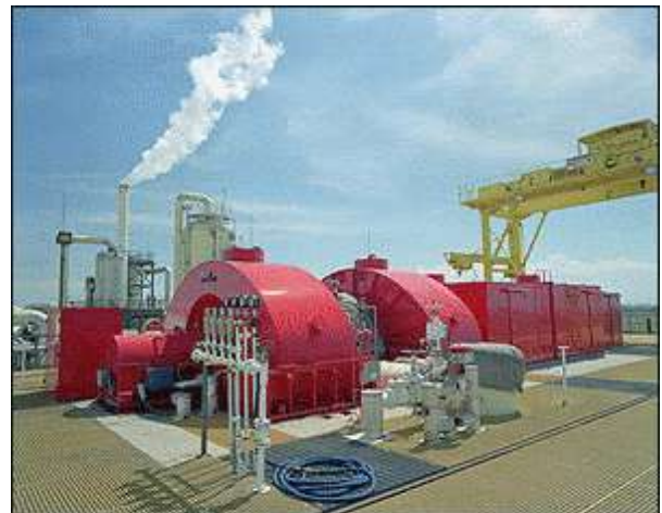
The Leathers Geothermal Power Plant at Calipatria, Calif.

CalEnergy has also built a $400-million facility to extract up to 27,216 tons (30,000 metric tonnes) of zinc per year from spent geothermal brines at its Salton Sea geothermal power plants.