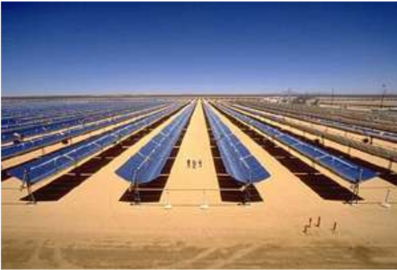
Engineers working at the Solar Energy Generating Systems (SEGS) facility in the Mojave Desert

The project will deliver 553 MW of solar power to PG&E’s customers in northern and central California. When complete, the Park will cover up to 6,000 acres (2,428 hectares), or nine sq. mi. (24.3 sq. km). The plant will use Solel’s solar thermal parabolic trough technology with 1.2 million mirrors and 317 miles (510 km) of vacuum tubing to capture the sun’s heat.